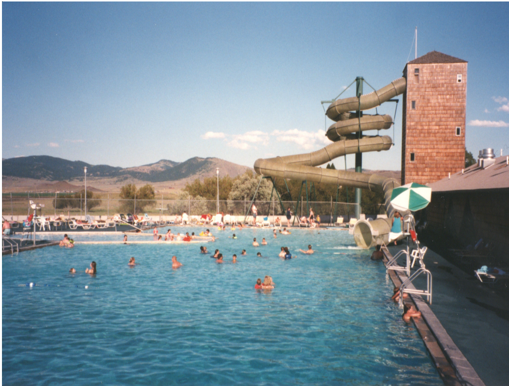
Outdoor pool at Fairmont Hot Springs Resort near Butte, Montana.