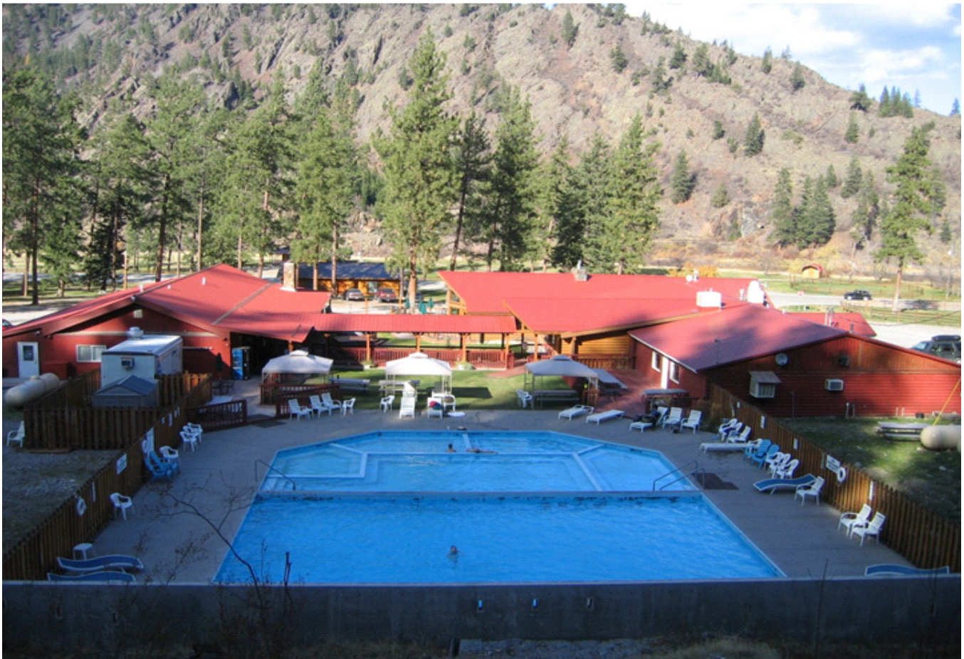
Outdoor pool at Quinn's Hot Springs Resort in Western Montana.

Owners of Montana hot springs resorts created the Montana Mineral Hot Springs Association in 1994 to address this chlorination issue. In 1995 the association helped pass a bill in the Montana Legislature that clarified water quality issues for Montana hot springs resorts. All natural hot springs pools at resorts may now operate without chlorinating their water, provided all of the hot water is exchanged in the pool at least once every eight hours, and the pools are drained and cleaned every 72 hours. This helped ensure the safety of all soakers while avoiding chlorination of the hot springs water. Temperature and pH in the soaking pools must also be carefully monitored.